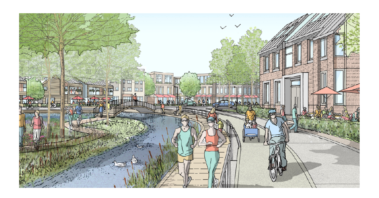
Figure 5 - Artists impression of Otterpool Park