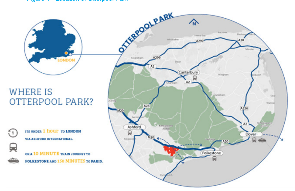
Figure 1 - Location of Otterpool Park