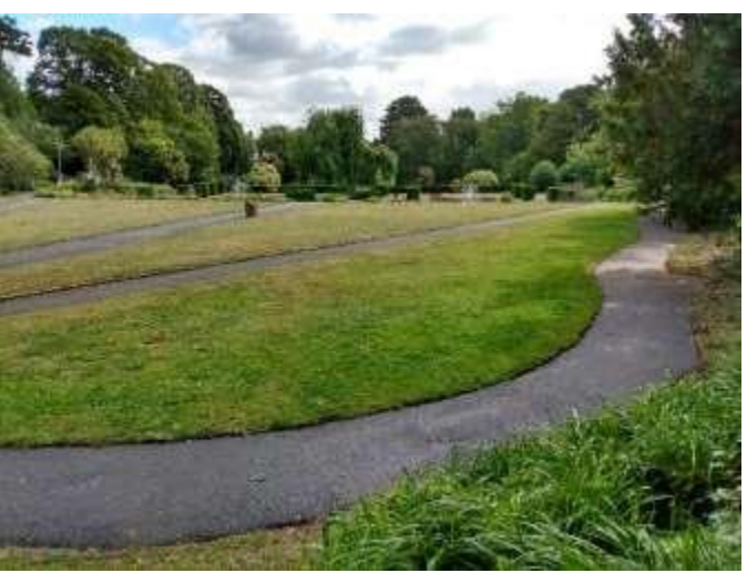
Upper garden proposed wildflower / bulb lawns