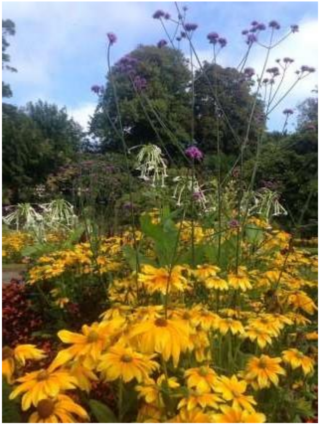
Pollinator attractive seasonal bedding scheme