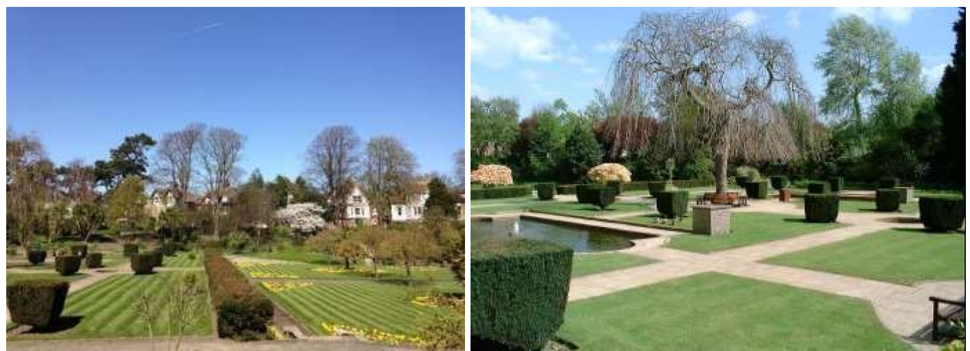
Spring colour in the gardens

Situated in the upper gardens, the rockery is a dry south facing area which was once planted with sub-tropical species of trees, plants and alpines. The traditional planting has been modernised, updated and redesigned with innovative Japanese style species which are more sustainable, having a low watering requirement. Inspired by the winter walk at RHS Harlow, the winter garden uses textures, brightly coloured stems and foliage, winter flowering and berry bearing species to enliven the upper gardens in the cold, dark months.