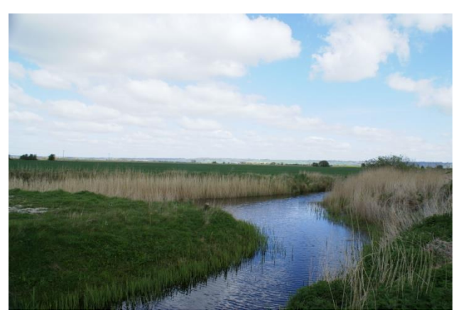
Romney Marsh Landscape

4.5.2 Particular concern has been raised regarding demand for wind and solar energy farms. The benefits of renewable energy are supported as is its application at a domestic level. However, large scale commercial proposals are not considered appropriate in the rural area because of their impact on the open landscape.