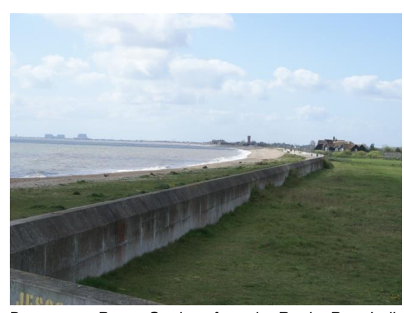
Dungeness Power Stations from the Rugby Portobello Trust land