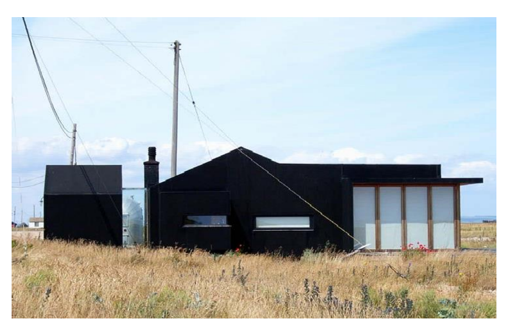
'Black Rubber' House designed by Architect Simon Conder (above) and the late Derek Jarman's Prospect Cottage demonstrate the increasing demand for sophisticated design