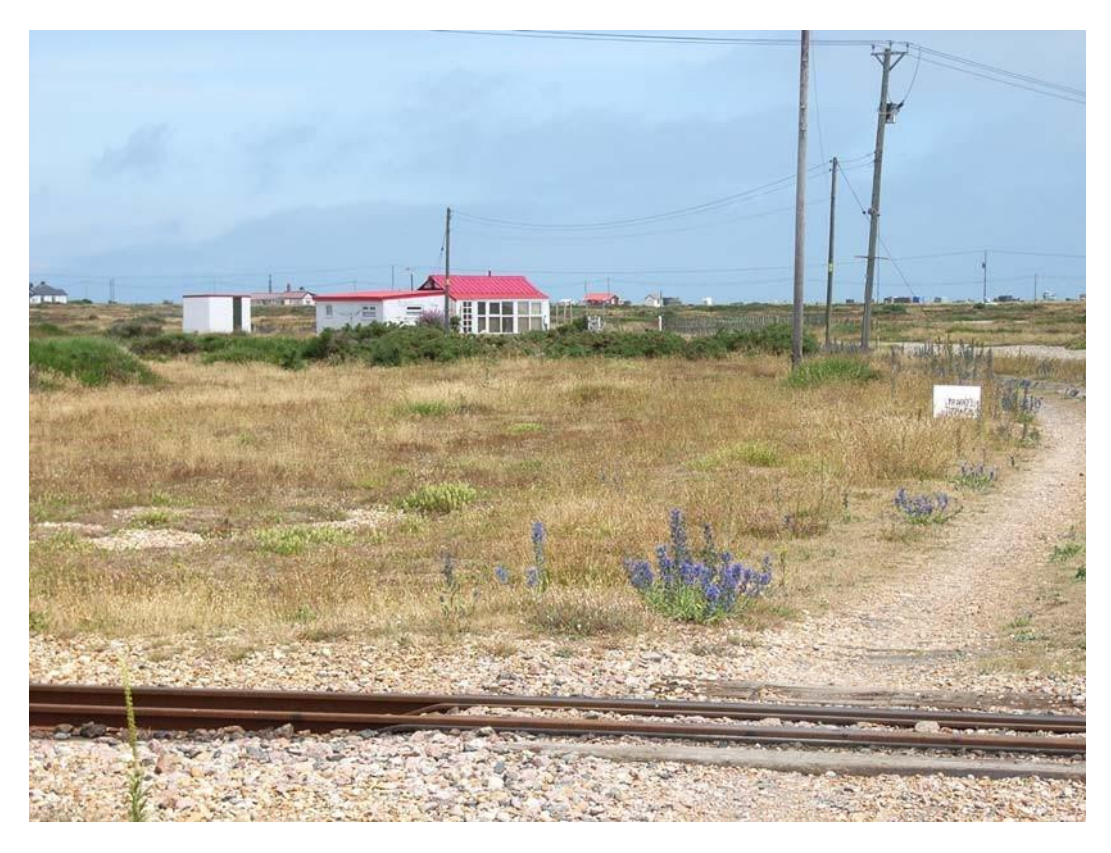
The Station Café, recommended for inclusion within the CA

Inspection of the area reveals a number of buildings which are clearly products of the same historical process as that which led to the present CA designation. One of these is within the loop of the RH&D Railway, others scattered to the west of the main line. The Station Café is also included in this group. A boundary extension is therefore recommended to take in these buildings. At the same time, it is also recommended that the boundary should be adjusted so as to clearly include the whole width of the railway and a small area of its setting to the west (see Appendix 2).