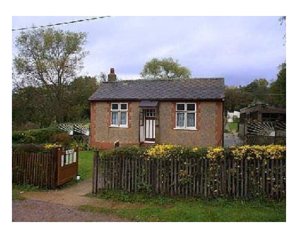
"The Haven" Plotland Museum, Langdon, Essex

However, the incipient self-help, self-build activity was to come to an abrupt end. The self-built shacks, chalets and shanties were considered by the powers-that-be a 'blot on the landscape' and the Second World War gave the authorities opportunity to destroy many of the coastal shacks as part of the Home Army's 'defence strategies'. With the 1947 Town & Country Planning Act, having brought such development under control, local policies soon echoed the sentiments of Patrick (later Sir Patrick) Abercrombie of 1926: