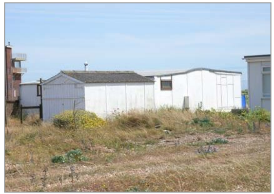
The evolution from railway carriage to a more permanent dwelling is still evident