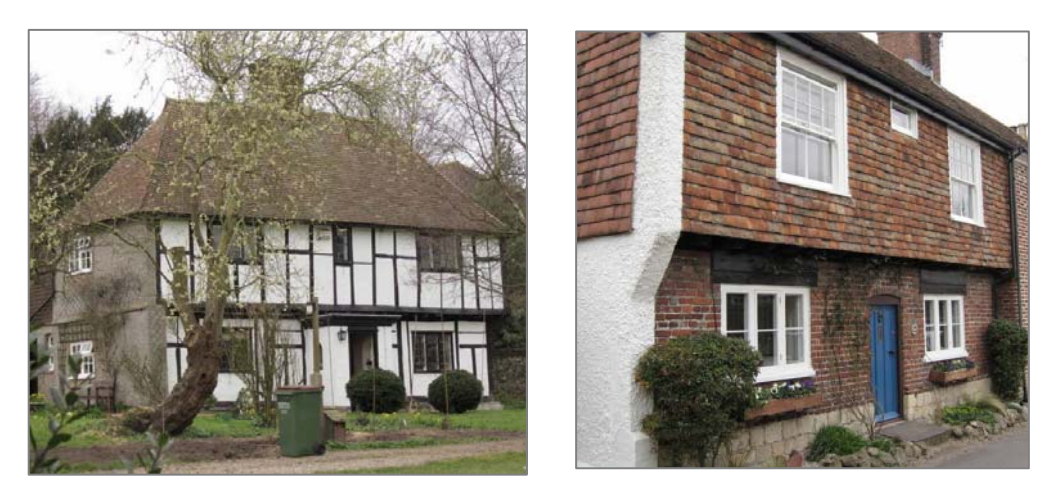
Timber framing, exposed and concealed: The Cottage (left) and Oak Cottage

60 Timber construction is in evidence in Elham's many fine oak-framed houses. Framing varies in style and quality, from the sturdy close-studding on the Abbot's Fireside, via the lighter box construction of the Manor House and Manor Cottage, to the flimsy framing of The Cottage. The timbers are now painted or stained black, with white plaster infill. Even where older houses have been refaced, their timber construction may still be visible in the projecting jetty brackets, as at Oak Cottage. In the C19<sup>th</sup> and C20<sup>th</sup>, timber framing returns as a purely decorative device, as at the Garage, or applied to an older building as at the Old Bakery. A few C19<sup>th</sup> buildings, like the cottages off Vicarage Lane or the barn behind the Rose and Crown, are faced with softwood weather-boarding.