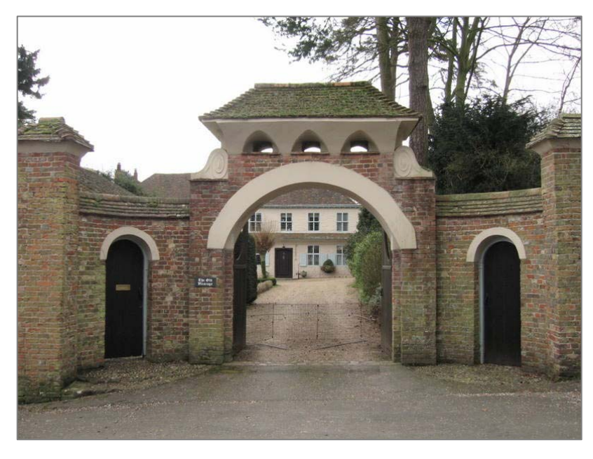
Gateway to the old Vicarage, with main house visible behind

54 Later C20<sup>th</sup> buildings have sometimes attempted continuity with earlier styles, usually with very limited success, while others have been built on purely utilitarian lines. Only the 1960s primary school (unlisted) shows the influence of stylistic Modernism, although this is softened a little by vernacular touches like weatherboarding and striped brickwork.