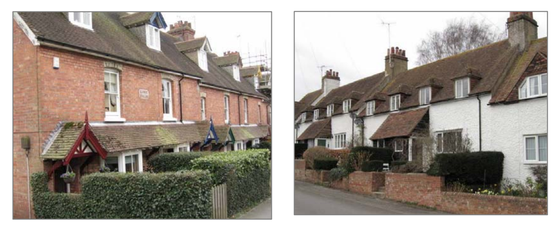
Left: Lime Villas. Right: cottages on Duck Street

57 The C20<sup>th</sup>, at least in its first half, made a number of pleasing contributions to the village. Bank Side and St Zita are a pair of substantial Edwardian houses with a first floor faced in ornamental tilework and an elaborately moulded segmental brick arch over the entrance. Lime Villas is a pretty red-brick Edwardian terrace, made charming by the little pentice roofs that run across the main front of each house pair, terminating in bracketed and barge-boarded porches with spike finials. Of a similar date but worlds away in style is the row of whitewashed cottages on Duck Street, which look almost like vernacular houses of the 18<sup>th</sup> century, but do not appear on any Ordnance Survey map prior to 1938.