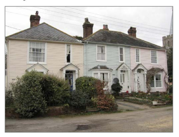
Cottages on Vicarage Lane

56 Flint Cottage on New Road and Holly Tree Cottage on Cock Lane present interesting double-pile variants on the same theme, both retaining their multipane sashes. Just off Vicarage Lane is a row of three rather charming weatherboarded cottages of the mid-19<sup>th</sup> century, with fanciful (possibly later) porches embodying miniature columns, barge-boards and other conceits.