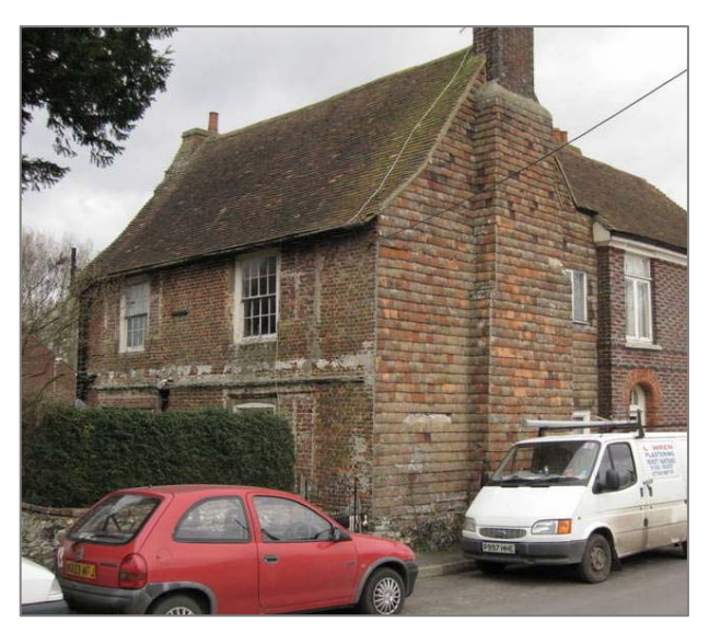
Water Farm, with blocked cross windows visible on main front

48 The Cottage on Cock Lane (grade II) shows a much more modest example of the same type, with far lighter box framing and plain jetty brackets. Similar framing, with surviving (or restored) frieze windows, can be seen at Manor House Cottage (grade II). Other post-medieval jettied houses now hide behind later brick and tile fronts, as at Oriel Cottage, Well Cottage and the King's Head (all grade II). One house of this period, Water Farm (grade II), seems to have been brick-built from the beginning: blocked C17<sup>th</sup> cross windows of moulded brick can still be seen in between later sashes on its main front.