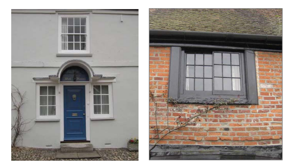
Left: doorway to Well House. Right: horizontally sash window at Monks Cottage

49 Although vernacular features survive in some more modest houses of the C18<sup>th</sup>, such as Windlass Cottage, Anne's Cottage and Mill House (all grade II), they tended to give way during this period to a rudimentary classicism. Elham's most pleasing piece of Georgian street architecture is actually another piece of refronting, Well House (grade II), where a timber-framed building has been very successfully hidden behind an almost symmetrical 3-bay façade of rendered brick, the entrance being treated as a serliana with an arched shell-hooded doorway flanked by two square-headed windows.