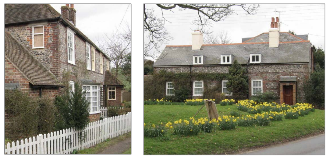
Flint walling: Holly Tree Cottage (left) and Chichester Lodge (right)

59 Four materials comprise the architectural palette of historic Elham: flint, timber, brick and tile. The first is best seen in St Mary's Church, which apart from the north porch's brick gable is walled entirely in knapped flint with limestone dressings, the latter replaced here and there with brick. Of the domestic buildings, only Chichester Lodge and Holly Tree Cottage are wholly flint-walled, although some others (Flint Cottage, Hunter's Moon, Mill House) incorporate some flint walling, and many of the older brick and timber houses rest on flint plinths.