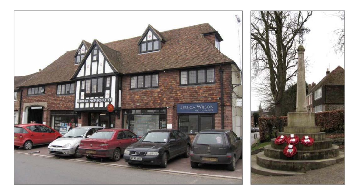
Left: the former Garage, now the Post Office. Right: the War Memorial

58 The old Garage is an appealing building of the inter-war years, its tiled carriage arch and five-bay mock-Tudor frontage cheerfully dissimulating its decidedly untraditional function. Finally there is the War Memorial, whose sophisticated design – six circular steps rising to a square plinth, upon which rests an octagonal shaft topped with an acorn finial and an elaborate wrought-iron crucifix – is attributed to the restorer of the church and vicarage, FC Eden.