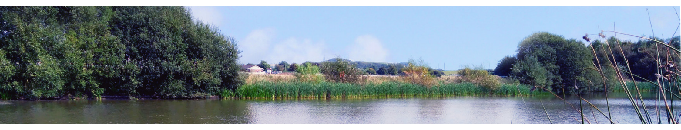
Pond at Folkestone Racecourse

Design Review: Principles and Practice Design Council CABE / Landscape Institute / RTPI / RIBA (2013)