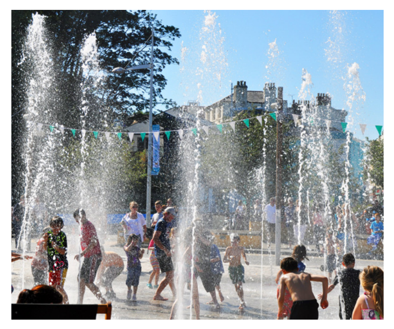
Fountains at Folkestone Harbour

As a public authority, Folkestone & Hythe District Council is subject to the Freedom of Information Act 2000 (the Act). All requests made to Folkestone & Hythe District Council for information with regard to the Otterpool Park Place Panel will be handled according to the provisions of the Act. Legal advice may be required on a case by case basis to establish whether any exemptions apply under the Act.