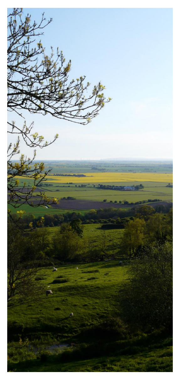
Land near Studfall Castle and Lympne Castle

The Place Panel's composition and remit reflect a review process that is multidisciplinary, collaborative and enabling.