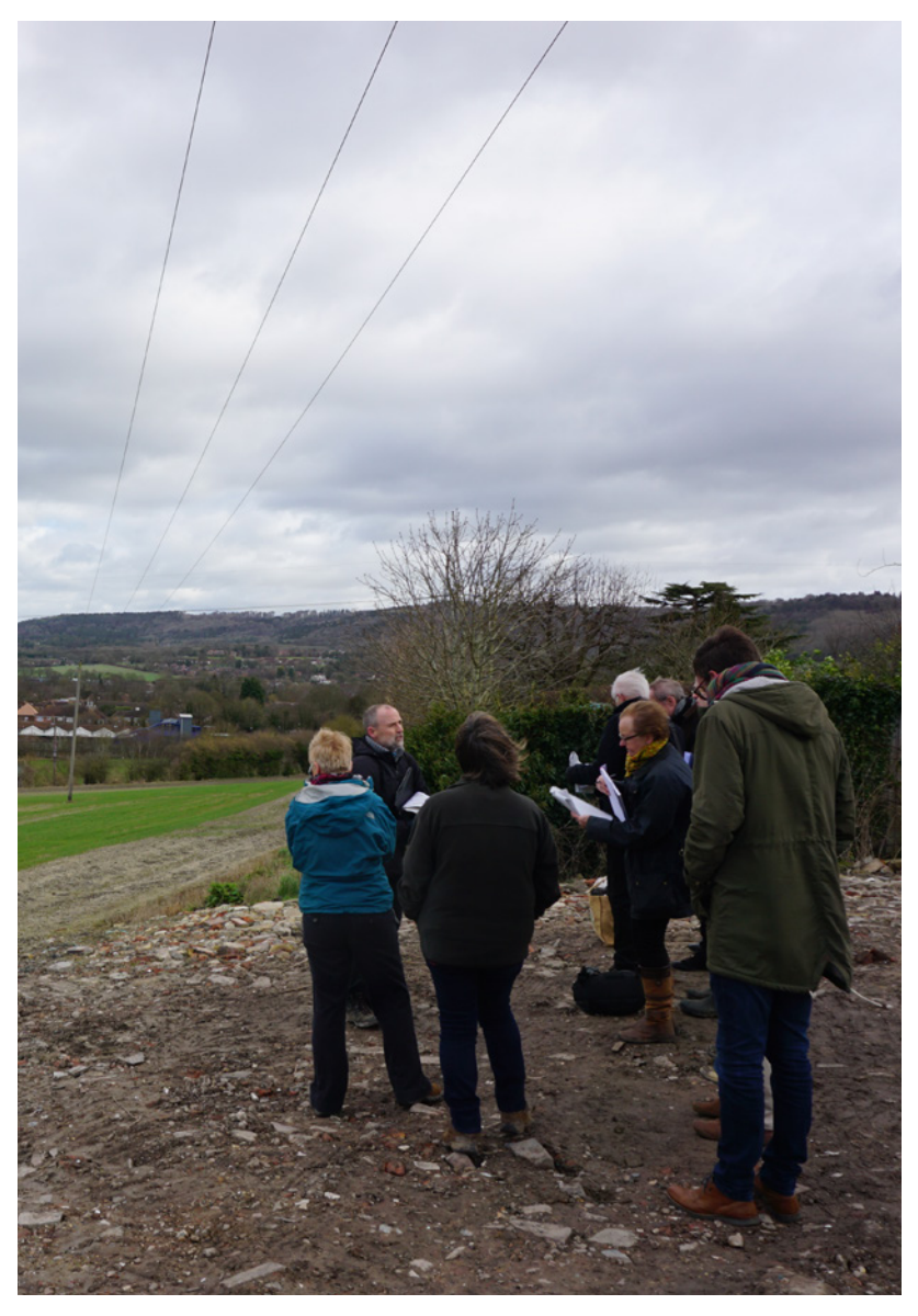
Panel site visit

From time to time, it may be of benefit for specialist advice to be provided beyond the Place Panel membership. In such cases, a professional with the relevant expertise may be invited to attend a review meeting, participating in the discussion with the status of an adviser to the panel.