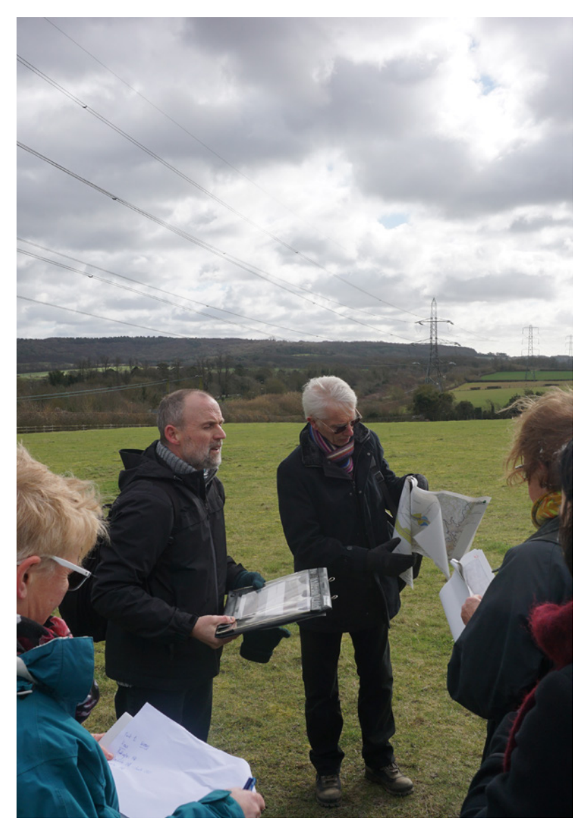
Panel site visit