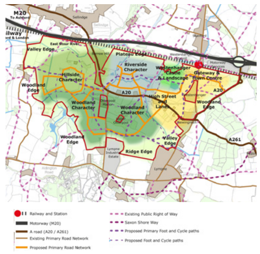
5 | Extracts from Otterpool Park draft Framework Masterplan Report: Access and Movement - All Routes (bottom) + Green Infrastructure (top)

centre and railway station to the west of Westenhanger Castle, with a high street running in a north-south direction to also extend the 'centre' of the town further south.