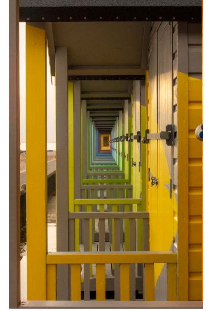
Beach hut image courtesy of Thierry Bal