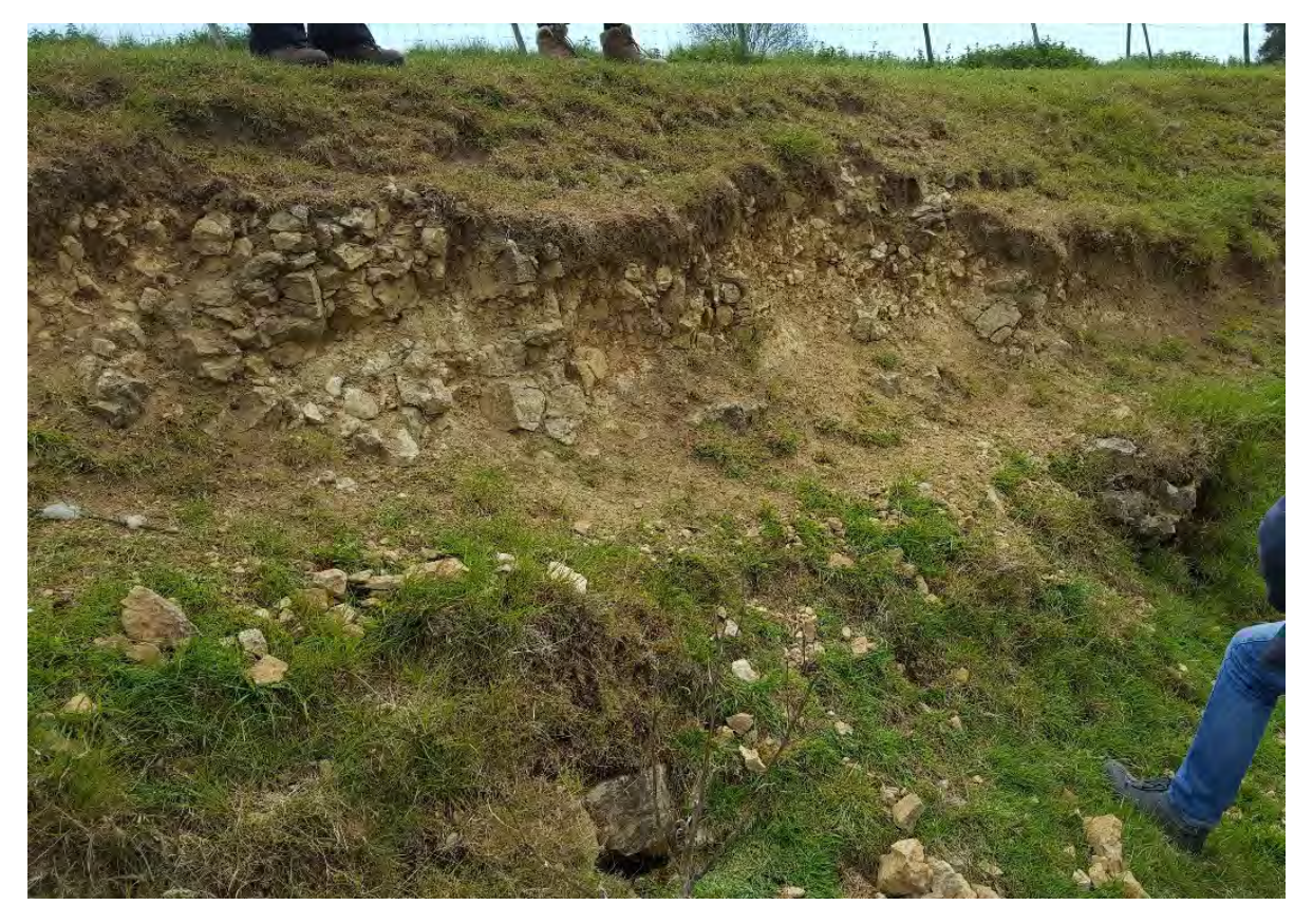
Plate 2: 'Rag and Hassock' Beds of the Hythe Formation (taken May 2017)

Chapter 10: Geology, Hydrogeology and Land Quality