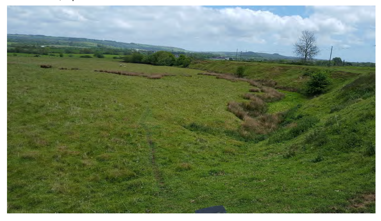
Plate 1: Looking northwest along the exposure, with the spring emerging in the foreground (taken May 2017)