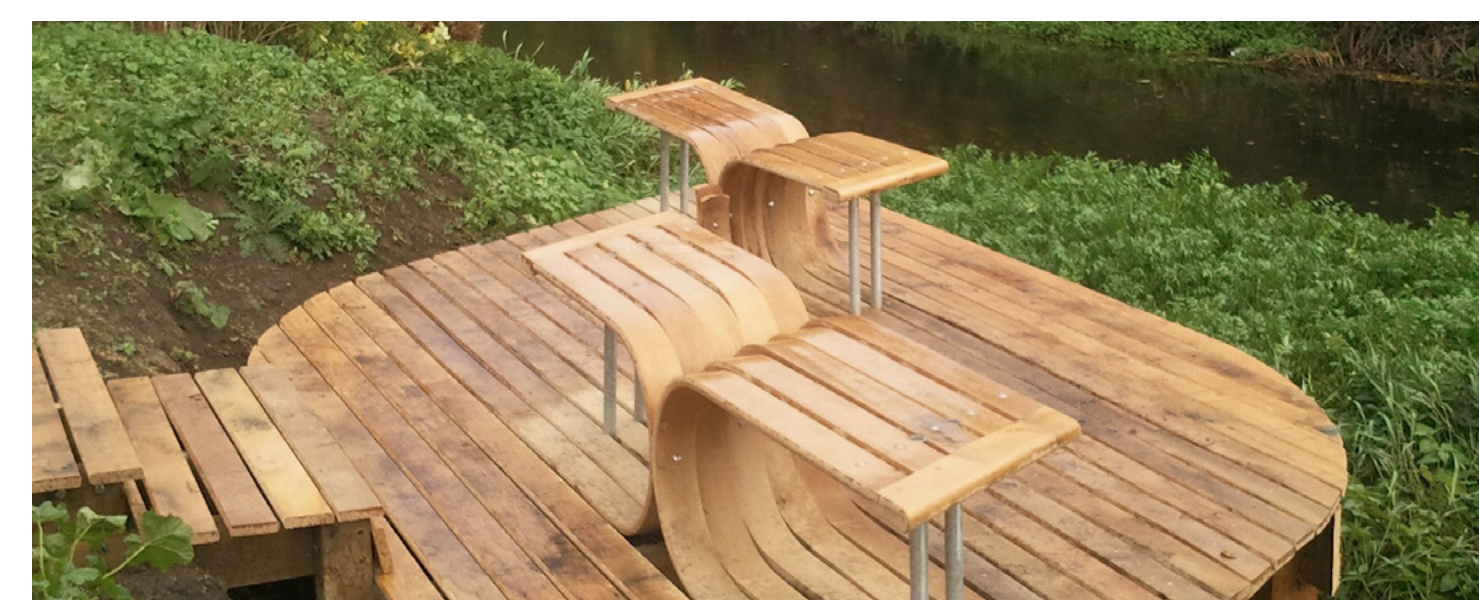
Photo credit: Peter Fry. Artist: Angus Ross. Images courtesy of Canterbury City Council.

4.4.2 Boundless Creativity: culture in a time of Covid 19 (2021): In response to the devastating impact on the sector due to Covid 19, DCMS established a research project with partners UK Research and Arts and Humanities Research Council (AHRC) to assess impacts on the cultural and creative sectors, providing recommendations for post-pandemic recovery. It also looked at innovation and emerging use of technology stimulated by the crisis.