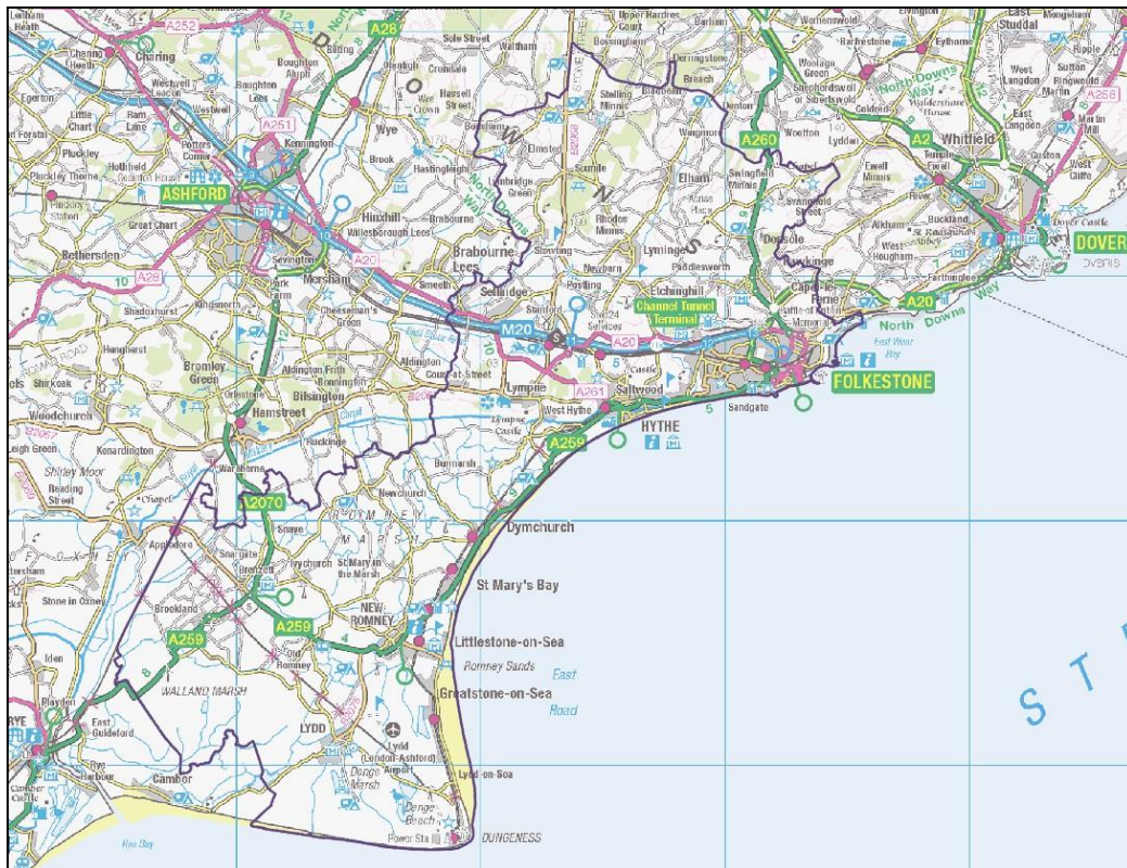
Figure 1: Folkestone & Hythe District Boundary