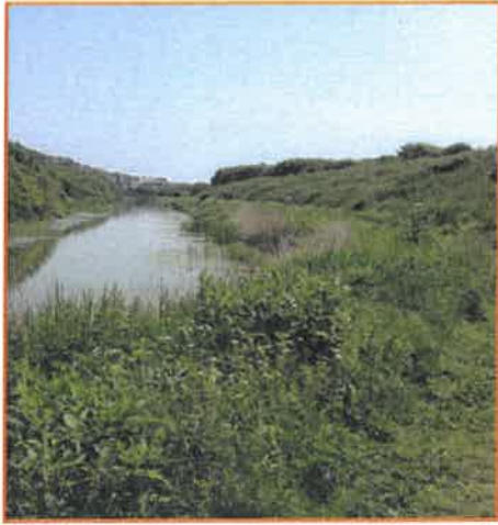
Figure 2.29: Princes Parade - footpaths on the canal