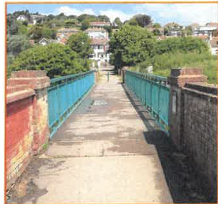
Figure 2.30: Central footbridge looking north