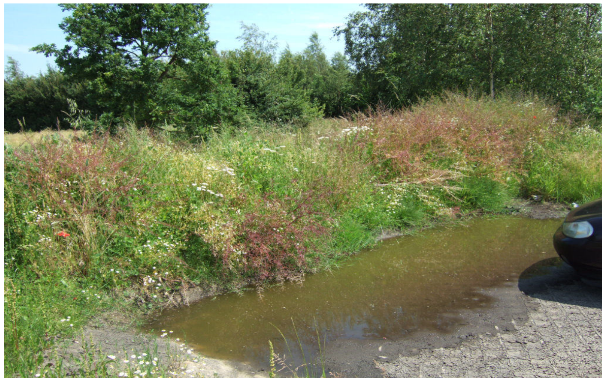
Plate 5: Location previously used for unauthorised encampments which has now been blocked off: piece of highway verge on the northern edge of the A257, East of Ash

guidance 26 for identification and referral of families. Where children and families are ‘slipping through the net’ of interagency working, valuable opportunities for support and appropriate intervention may be lost.