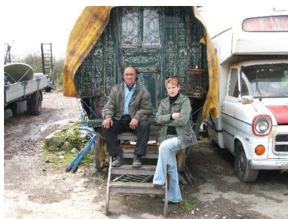
Plates 3 & 4: Unauthorised Private Site, Whitstable