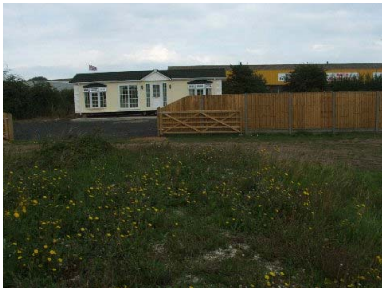
Plate 1: Private Site, Herne Bay (temporary planning permission)

East Kent Sub-Regional GTAA: Canterbury City Council, Dover District Council, Shepway District Council and Thanet District Council