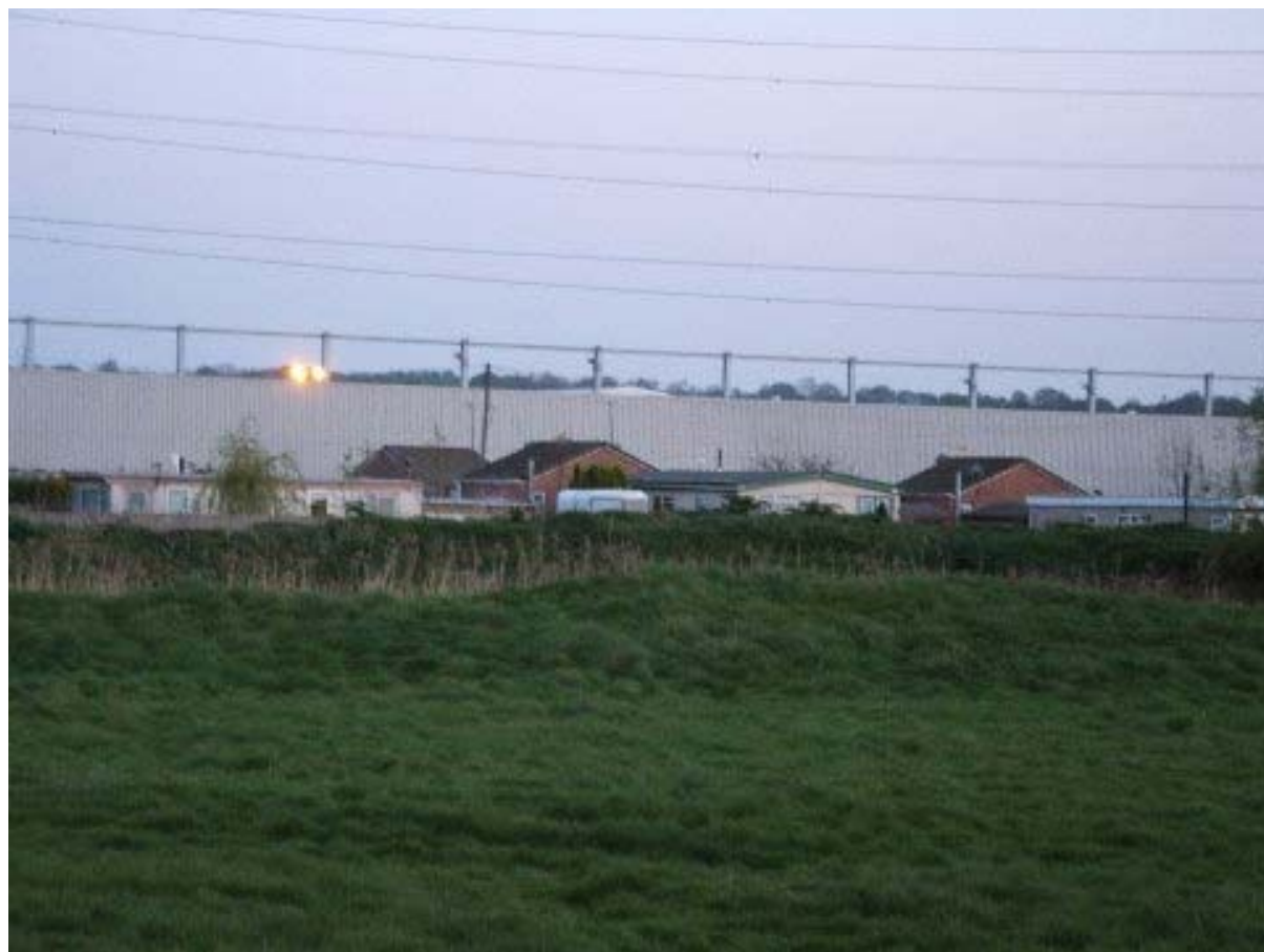
Plate 2: Local Authority Site, Vauxhall Road, Canterbury

East Kent Sub-Regional GTAA: Canterbury City Council, Dover District Council, Shepway District Council and Thanet District Council