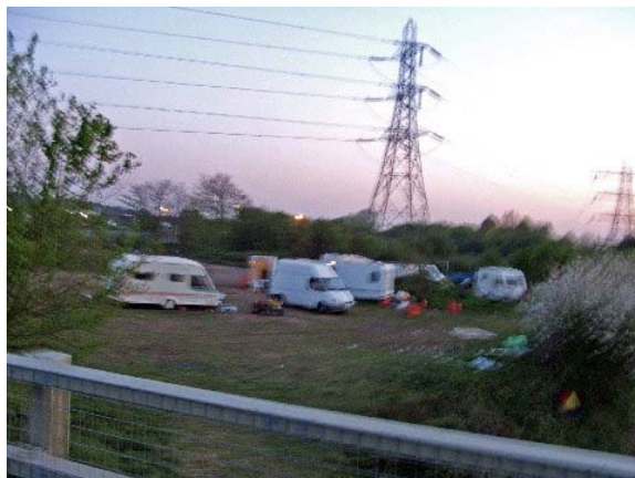
Plate 6: Unauthorised Encampment Opposite Greenbridge Site, Vauxhall Road, Canterbury