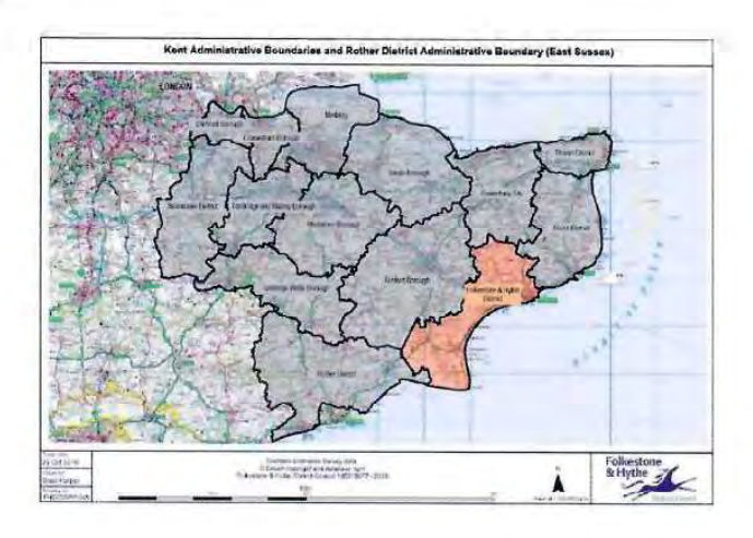
Figure 2.1. Geographical relationship between FHDC and Kent and East Sussex