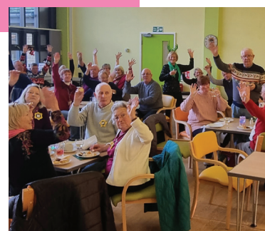
Jewels: Romney Marsh Community Hub volunteers.

"They are the jewel in our crown and we are so very grateful for all that they bring."