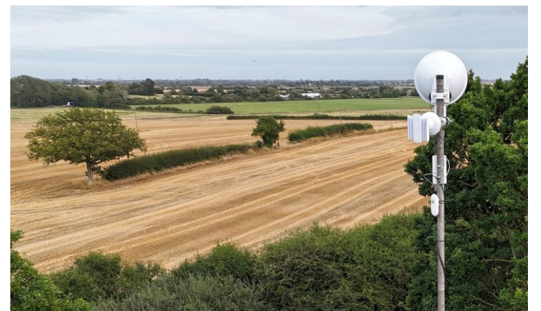
Expansion of 5G wireless broadband on Romney Marsh thanks to the support of the Rural England Prosperity Fund.