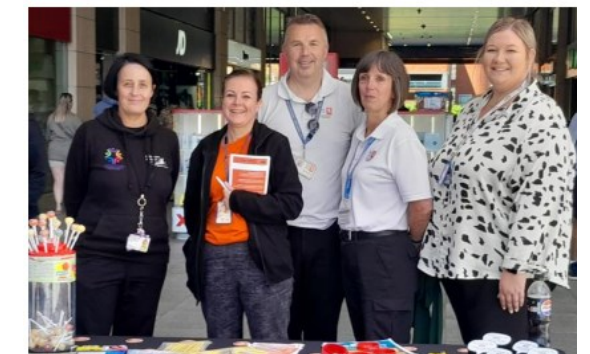
Operation Sceptre with multi-agency partners