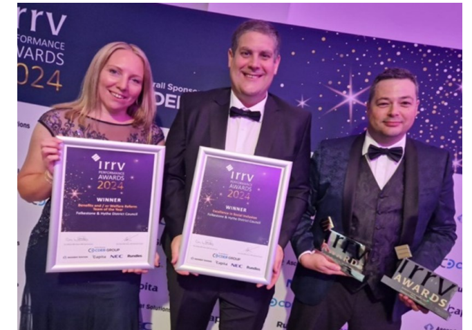
Council Tax, Benefits and Welfare Team winning at the IRRV National awards ceremony

Drop-in event for Folkestone Sports Centre staff: Following the closure of Folkestone Sports Centre in July 2024, due to the Charity running the centre calling in the administrators, the council hosted a drop in event at the Civic Centre for sports centre staff affected by the closure on 9th August 2024. The staff were able to talk to members of the council's welfare team and guidance was given around sources of assistance. In addition, there was advice on training opportunities, applying for jobs and support offered around interview skills. Staff from the Department of Work and Pensions and East Kent College were also in attendance at the event to give advice.