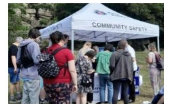
Summer Safety Event in the Coastal Park