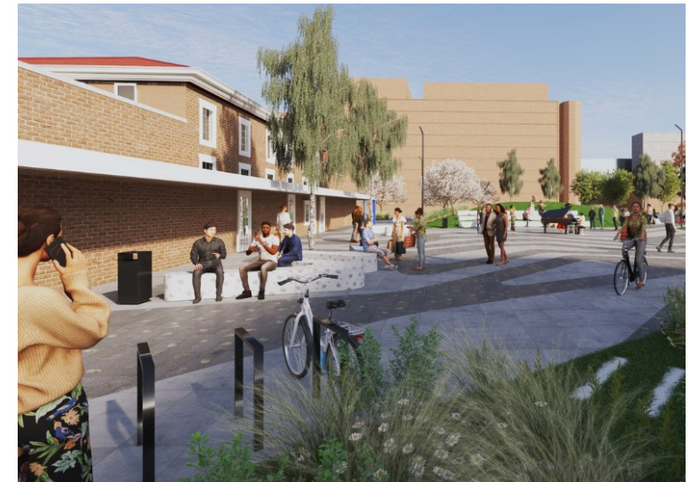
Artist impression of Bouverie Square as part of the wider regeneration relating to the 'Folkestone - A Brighter Future' project

Engagement with Local schools: During the year the council has engaged positively with local schools to support pupils to access jobs, both at the Council and beyond. We have produced a short video and worksheet on interview techniques for local young people and distributed this via schools, colleges and the Family Hub. We have worked with the Beacon school running practice interview sessions and delivered a workshop on interview skills for Year 10 pupils at Folkestone School for Girls. We have run careers events at The Marsh Academy, Folkestone School for Girls, Folkestone College, and at the Council (attended by Folkestone College, William Harvey Grammar School and Birchwood School). We also had a stand at the Romney Marsh Inspires careers event for the Marsh Academy and The Lighthouse. In addition to this, we supported the drop in event for former Folkestone Sports Centre employees providing advice on training opportunities, applying for jobs and interview skills.