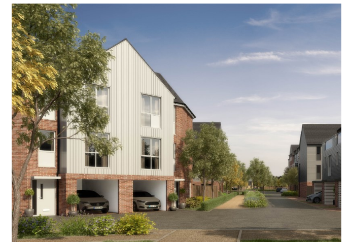
Approval of 26 new green homes to be built at Boundary Road in Hythe