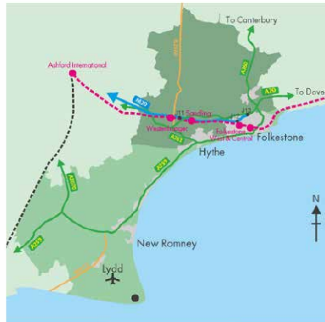
Folkestone & Hythe District

13.4% in the tourism sector 12.3% in the knowledge economy 8.7% in the creative sector, growing almost 7% over the last 5 years 5.2% in food and drink production 4.8% in manufacturing