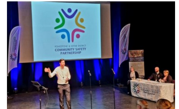
Community Safety Partnership Annual Event