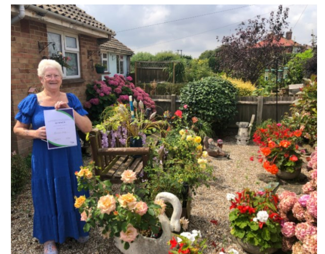
Tenant with an award for her front garden as part of the annual gardening competition managed by STAP.