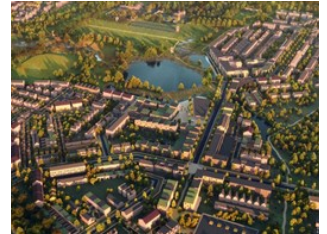
Collaboration with Homes England on bringing forward new homes at Otterpool Park was agreed in the year.

Net zero pathway at Otterpool Park: In February 2025, A proposal aimed at providing sustainably sourced energy for new homes and businesses planned at Otterpool Park was approved. The council's Cabinet supported the "pathway to net zero" by agreeing that a renewable energy company take on the role of bringing forward a sustainable power supply scheme and obtaining the necessary planning consents. The proposal is to create on-site electricity generation via roof-top solar and a solar park with battery storage, all connected via a smart grid. It is estimated that 50% of the average annual demand of the 8,500 homes planned for the new town could be generated on site with the remainder coming from suppliers of renewable energy via the national grid making the new town net zero in operation.