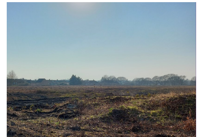
The Biggins Wood site in Folkestone will see new affordable homes and employment space delivered.