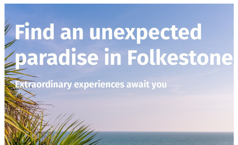
A new tourism campaign aimed at attracting even more visitors to our amazing district