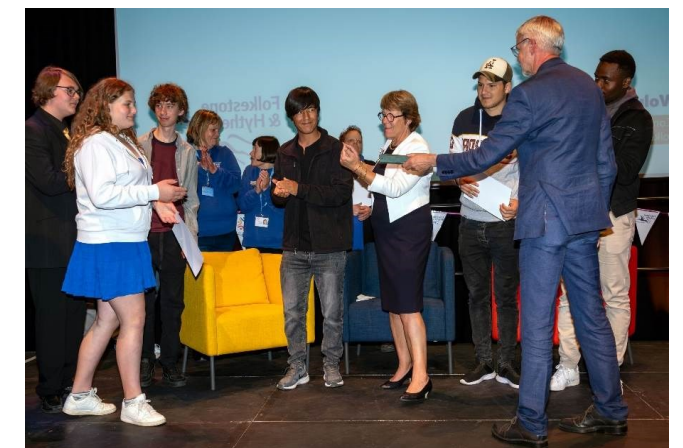
Excellence in Volunteering Awards celebrates the contribution volunteers make daily in local communities