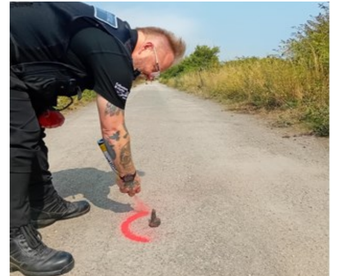
Environmental Enforcement Officer on patrol at The Warren, Folkestone