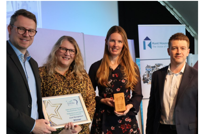
Housing Award for leading a decarbonisation project to improve the energy efficiency of council-owned homes.

No use empty scheme: In February 2025, a building which was left to decay for nearly two decades has been refurbished thanks to the support of a council initiative. Five new flats have been created in the five-storey town house located in Augusta Gardens, Folkestone, following three years of work by Browns Construction – backed by the No Use Empty scheme. Now in its twentieth year, the Kent County Council-led programme helps fund the renewal of derelict properties by bringing them back into residential use. Folkestone & Hythe District Council was one of its founding partners and, in 2014, introduced top up loans to help tackle some of the