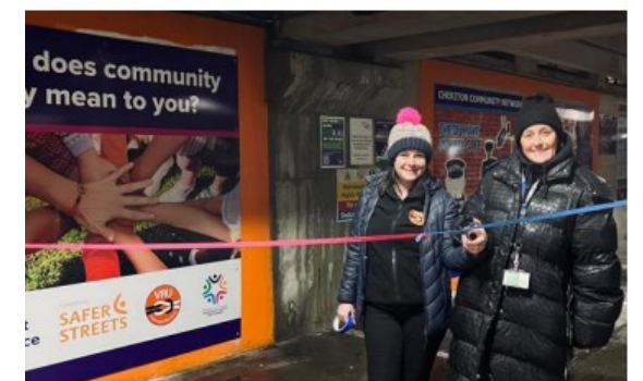
Sandgate Road Car Park Artworks