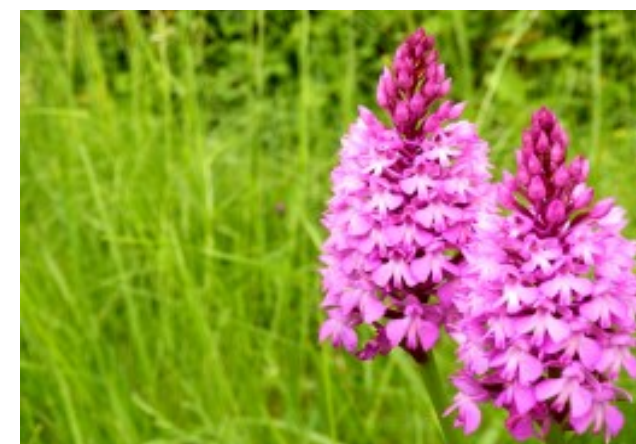
Rare and distinctive pyramidal orchid found near the Royal Military Canal in Hythe