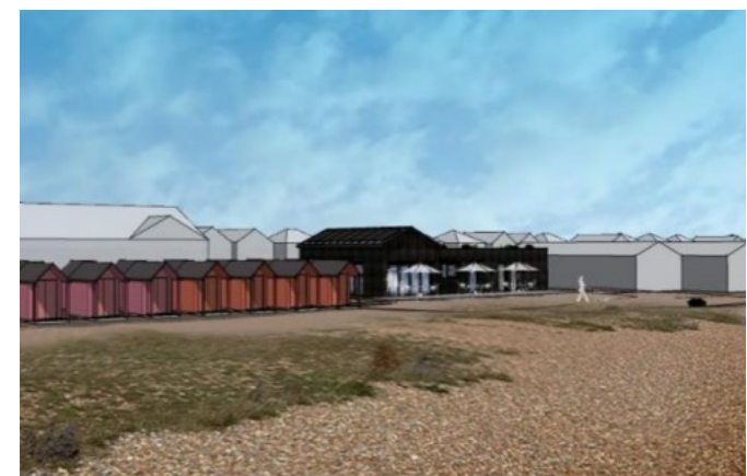
Plans for a new visitor hub, improved water sports facilities and 93 beach huts at Greatstone were approved in the year