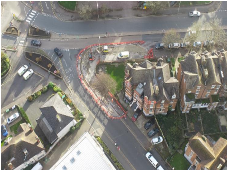
Current works at Shorncliffe Junction.

As you may be aware we have started working along Shorncliffe junction. In this area we have successfully switched traffic management, erected safety fencing and slightly narrowed lanes. We have disconnected and removed redundant Belisha beacons and signs, broke out redundant kerbs and footways, and have removed redundant railings. We have installed new streetlighting ducts, installed and energised new streetlighting columns. Over the next upcoming month, we will be installing new kerbs and edgings, footway covers, tactile and corduroy paving slabs, new Belisha beacons and signs.