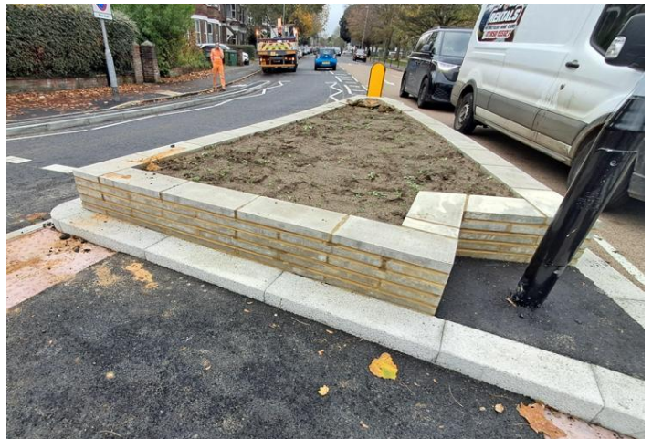
New zebra crossing, and Belisha beacons have been installed, creating safer crossing points, and cycle lanes.